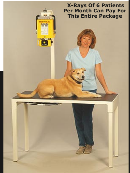
X-Rays Of 6 Patients Per Month Can Pay For This Entire Package

Get Ready To Be Pleasantly Surprised With The Penetration & Film Quality Achievable With This Great System